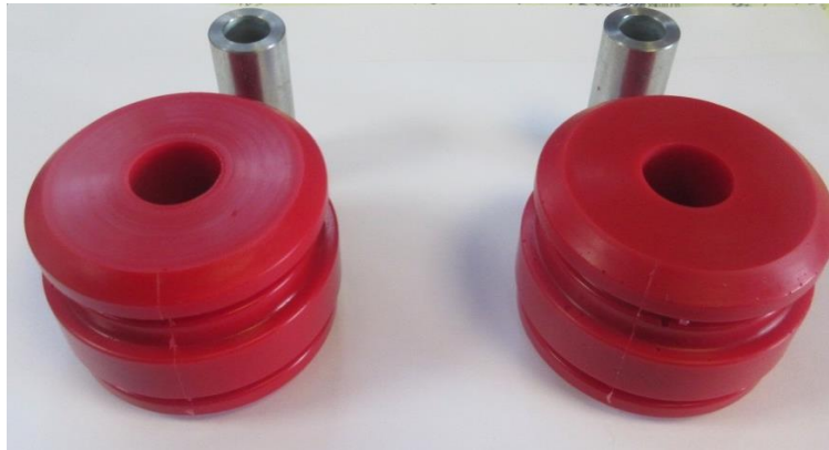
2x 40BN Polyurethane Pieces and 2x 40BN Tubes

The bush should be fitted to the wishbone such as the thicker part of the bush faces the floor.